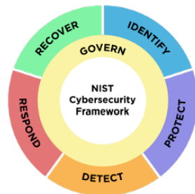
Fig. 2. Framework Functions

National Institute of Standards and Technology (NIST) Cybersecurity Framework (Version 2.0 open for comment)